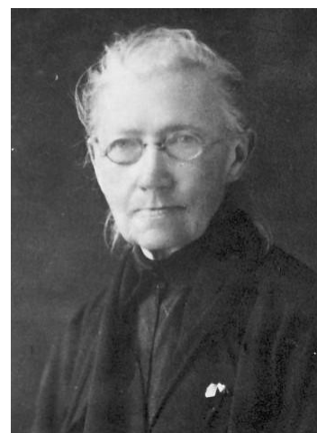
Sofia Fedorivna Rusova, 1856–1940. Internet Encyclopedia of Ukraine

Sofia Fedorivna Rusova (1856–1940) was a leading figure in the Ukraine Ministry of Education, a political activist, particularly in the Ukrainian Party of Socialist Revolutionaries, a vocal proponent of women's rights, and a writer of books